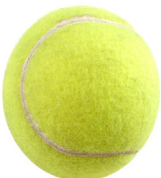
Tennis Ball = 2 ½ inches