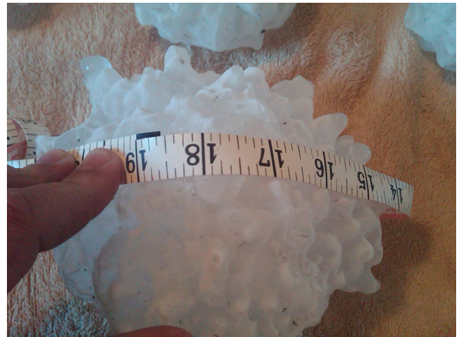
The largest hailstone recorded in the U.S. at 8 inches in diameter and 18.62 inches in circumference.