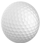
Golf Ball = 1 ¾ inches